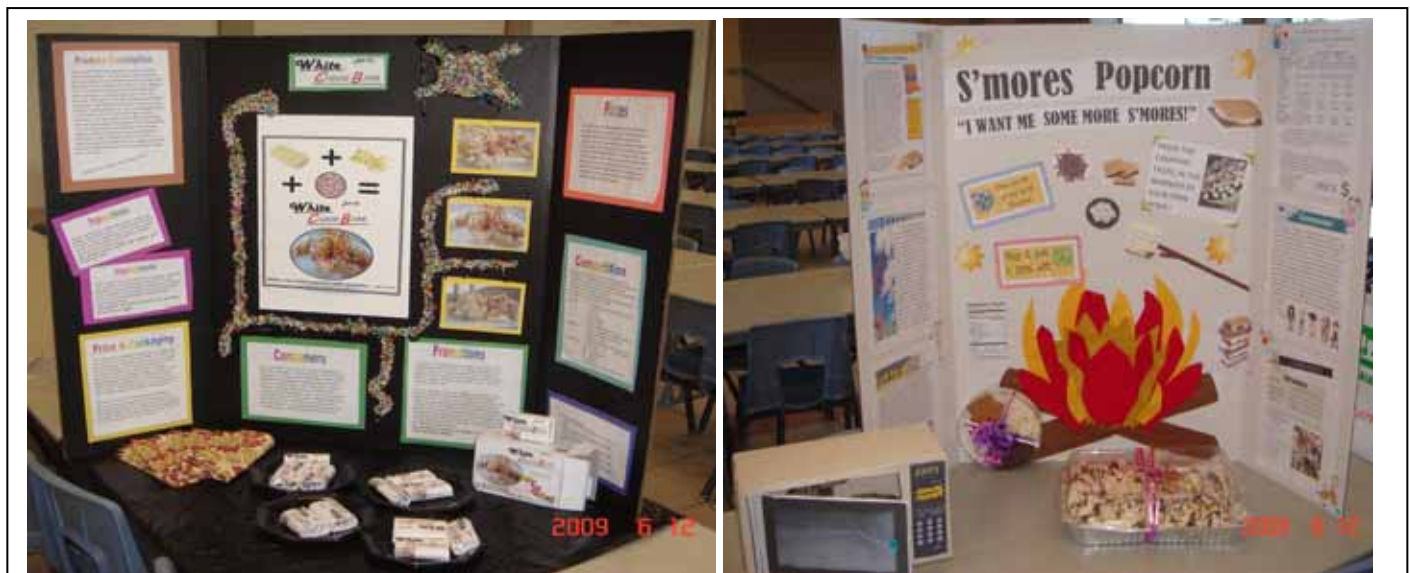
Examples of display panels for the Grade 10 Introduction to Business popcorn project.

Grade 11 Accounting students learned how to perform the entire accounting cycle for a small business, and taught their peers about major recent accounting scandals. On their field trip to George Brown College, Grade 11 Marketing and Accounting students experienced first-hand lessons from business professors as they caught a glimpse of post-secondary life.