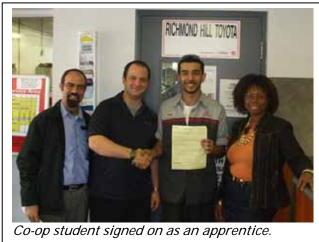
Co-op student signed on as an apprentice.

banking and accounting, law, a bakery and a hair salon. Congratulations to four of our Ontario Youth Apprenticeship Program (OYAP) students who were signed as apprentices – two as Automotive Technicians, one Hair Stylist and one Baker. In addition, and in spite of the economic conditions, we are happy to report that three of the students have been hired by