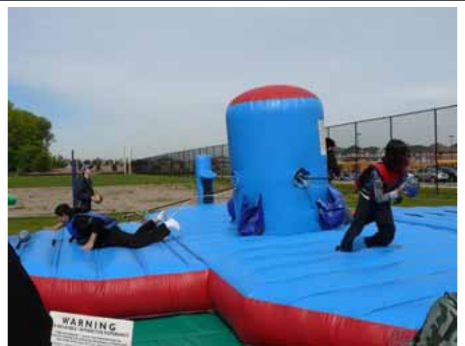
Some students are challenged on the ropes at the carnival organized by the Student council in June.